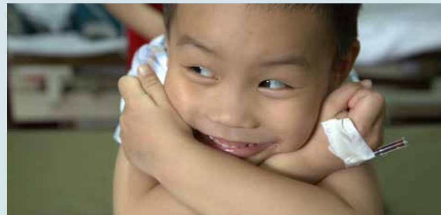
International Thalassaemia Day 2014 Photo Contest, 1 st Place

New drugs and their impact on the pathophysiology and management of thalassaemia